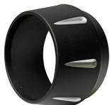
1860-0662 (BESMR) Optional Contrast End Cap.

Road Rage HS - 2 into 1 Chrome collector system - 1 \frac{3}{4} " to 1 \frac{7}{8} " Chrome stepped head pipes and a 2 \frac{1}{2} " to 4" dia x 12" short Chrome megaphone muffler with a polished billet end cap that is removable via a stainless button head allen bolt - oxygen sensor ports and plugs - fits '86 - UP Softail models - 2 \frac{1}{4} " dia. x 12" long baffle (B2212) wrapped in woven roven fiberglass matt is removable and serviceable, moderately aggressive sound - includes full coverage Chrome heat shields