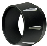
1860-0662 (BESMR) Optional Contrast End Cap.