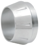
1860-0496 (ENDCAP-SM) Optional Polished End Cap