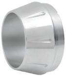
1860-0496 (ENDCAP-SM) Optional Polished End Cap

Road Rage – 2 into 1 collector system with stepped Chrome head pipes (1 \frac{3}{4} " – 1 \frac{7}{8} ") and 4" dia. Chrome megaphone muffler (short) with a 4" Black Anodized With Polished Billet Accent End Cap [BESMR] that is removable via a stainless button head allen bolt – oxygen sensor ports – fits all Rocker, CVO Springer, and Breakout models – 2 \frac{1}{4} " dia. x 12" long baffle (B2212) wrapped in woven roven fiberglass matt is removable and serviceable, very aggressive sound – includes full coverage Chrome heat shields for the head pipes